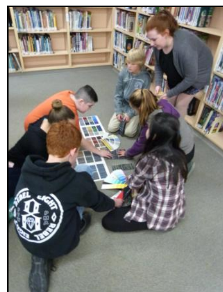
Student Design Committee Members Discussing Interior Colours

We continue to meet with the student design committee monthly on flex days and their input has been invaluable. Thanks so much committee members!